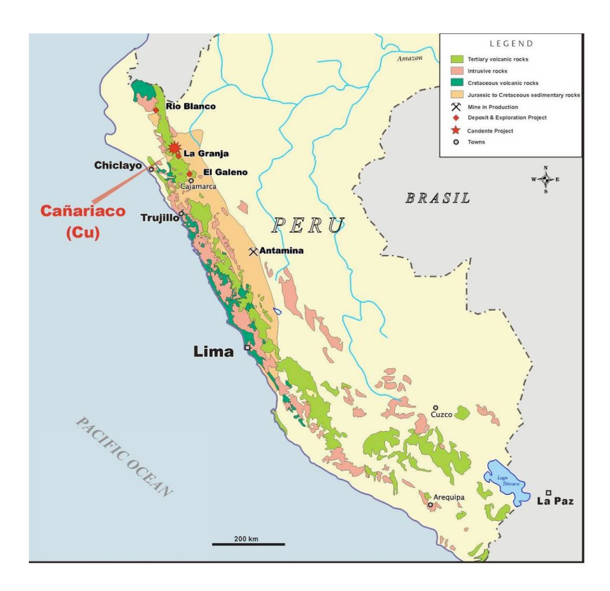
MINERAL TENURE, SURFACE RIGHTS, AND ROYALTIES

The Cañariaco Copper Project consists of 6 Cañariaco concessions, covering a total area of 5,229.50 hectares.